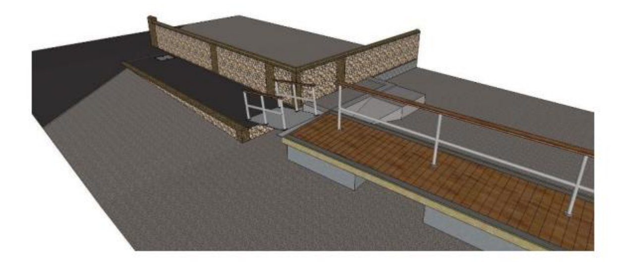
Figure Two: Raised landing design.

Figure one: Final overall design of the jetty.